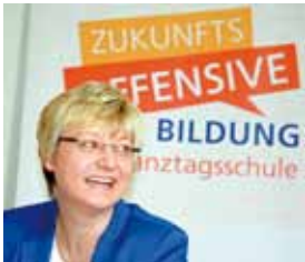
Frauke Heiligenstadt Lower Saxony Minister of Education

You will find this a valuable basis for making a well-informed decision about your child's continuing education. The shared aim should be that your child is happy and keen to rise to the challenges of the type of education chosen.